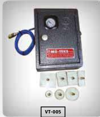
Chamber Control Aparatus / Vacuumtest (With Air)