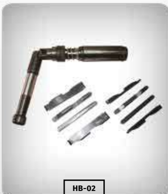
Honing Head (45-65 φ)