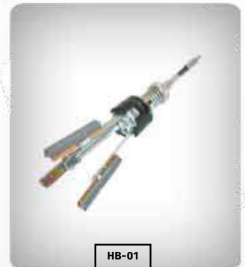
Honing Head (Movable)