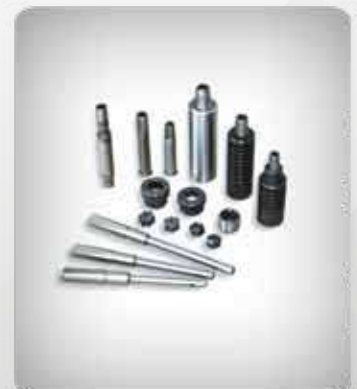
Stone Mandrels and Pilot Shafts