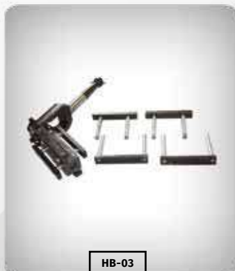
Honing Head (65-215 φ)