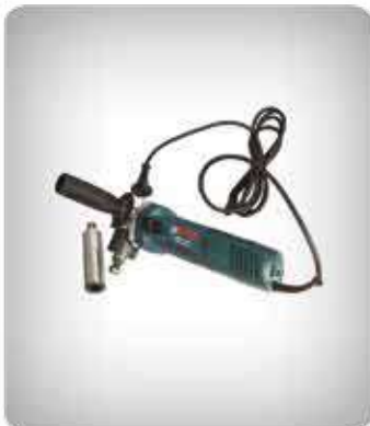
Valve Chamber Grinding