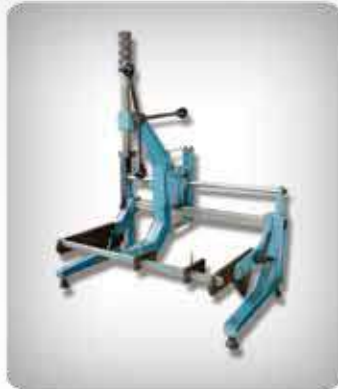
Valve Spring Assembly and Diassambley Bench Apparatus