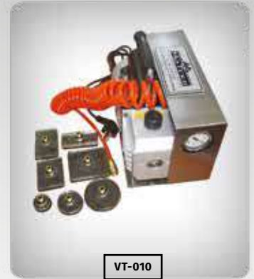
Chamber Control Aparatus/Vacuumtest (With Electric)