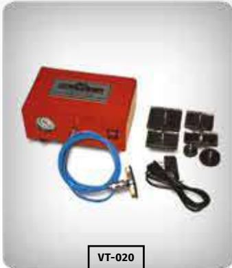
Chamber Control Aparatus/Vacuumtest With Electric