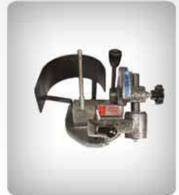
Angel Sharpening Aparatus