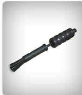
Tire Removal Apparatus